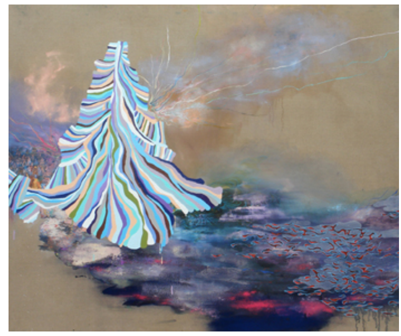
Oil and mixed media on linen, The Uppermost Highest...by Jackie Tileston