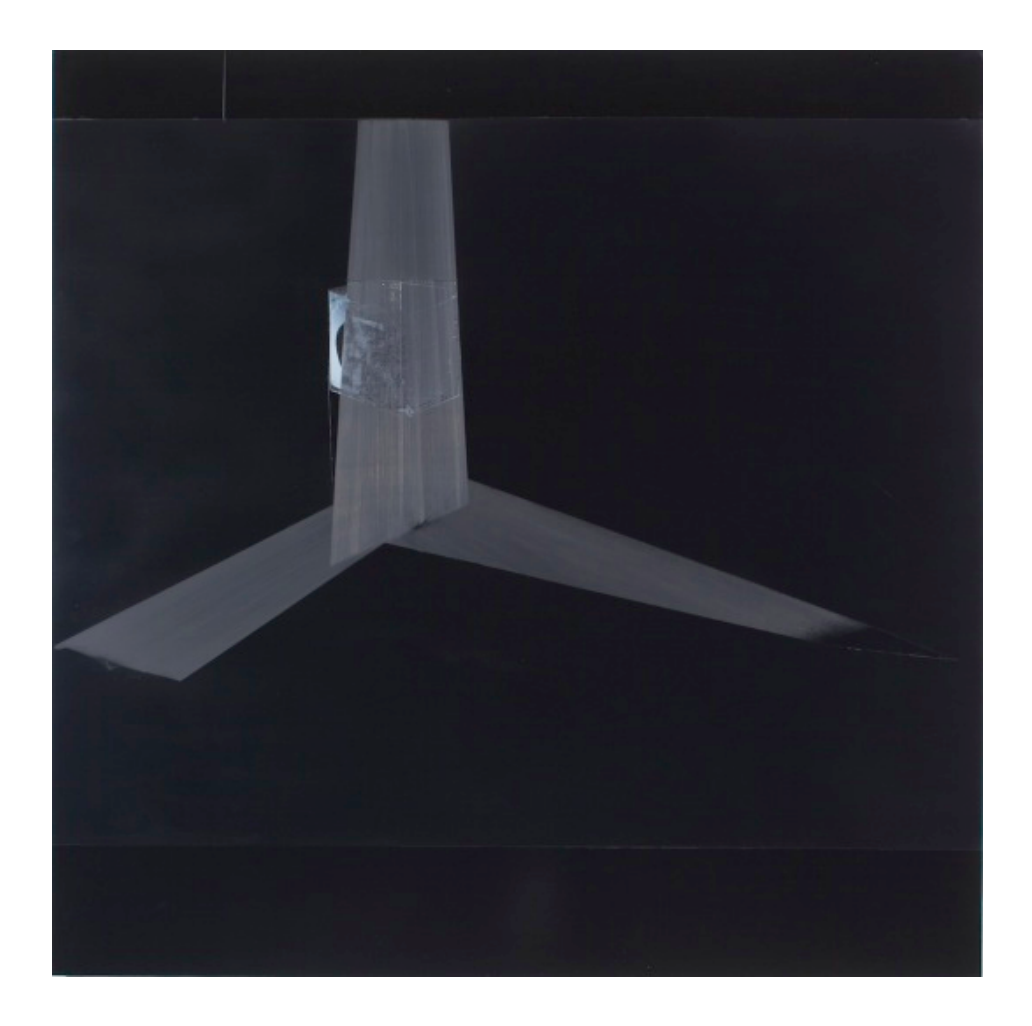
Trefoil, 2010 | Acrylic and enamel on resin-coated panel, 47 x 47 inches

The Portal series was an effort to show a crack in the fabric, perhaps a reveal of another world. Not so much an escapist world, but a glimpse into what's really going on. A bit more like the possibilities that quantum mechanics reveal. I'm always wanting to take a closer look at possibilities and at my own misunderstandings—that is what Portal was about and it is also what the recent black work is about... The "black" work is more about a slow reveal and less about a crack in the fabric. I had a more meditative approach to these paintings and I've been told the viewing process is also meditative, and the associations go into vast territory.