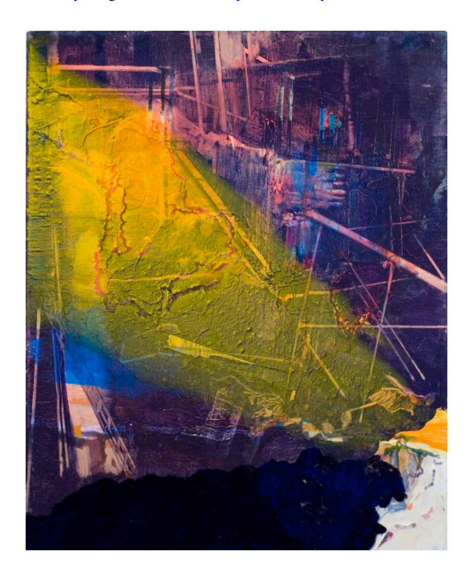
Ghosts of Industrial Past, 2008 | Oil on canvas, 30 x 24 inches

Filed under: Noteworthy | Tags: Michelle Mackey, Noteworthy