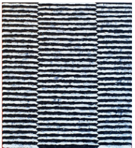
Above: "Wiggle" @ Slow