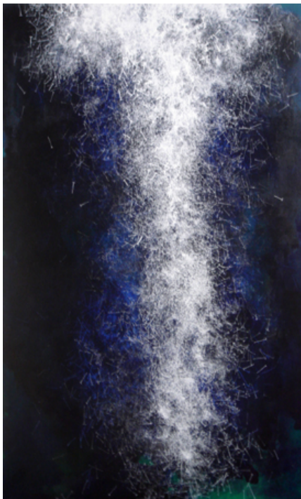
45,328 (Nails) - 48.25 x 30