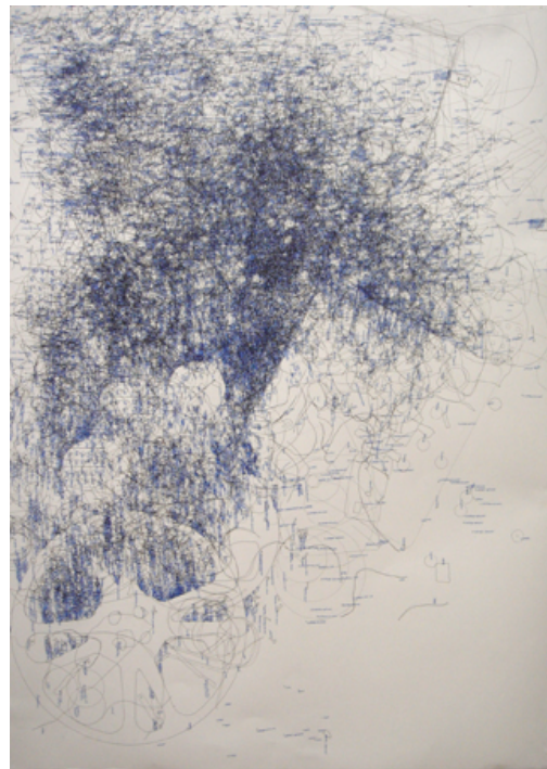
Inventory - 2011 -50x36

His mark-making dominates the visual experience by repeating forms and motifs (the traced nail and the written word continue to be evident), combined with excruciatingly micromanaged detail. He also uses an arsenal of tools to add texture to many of the works background surfaces; yet in other works, the surfaces remain pristine. The compulsive and accumulative quality of much of this work makes it clear that they are labor intensive and precise, mirroring the methodologies of rule-based art.