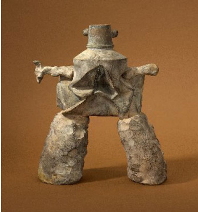
Personnage by Joan Miró is on display at the Gerald Peters Gallery.

Joan Miró bronzes at Gerald Peters: It's a fantastic opportunity to see the fantastic: Sixteen bronze Joan Miró sculptures, created during the last three years of his life, are showing at the Gerald Peters Gallery.