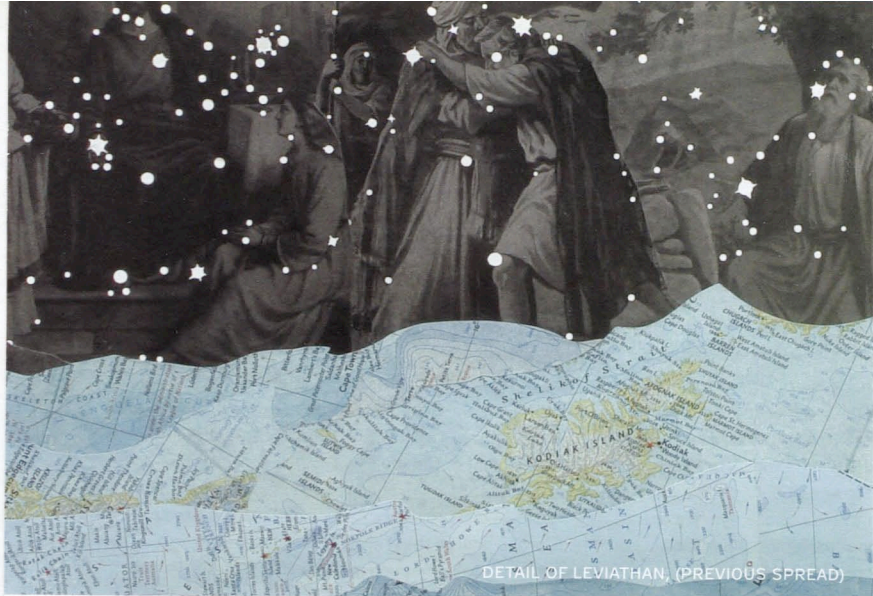
DETAIL OF LEVIATHAN, (PREVIOUS SPREAD)