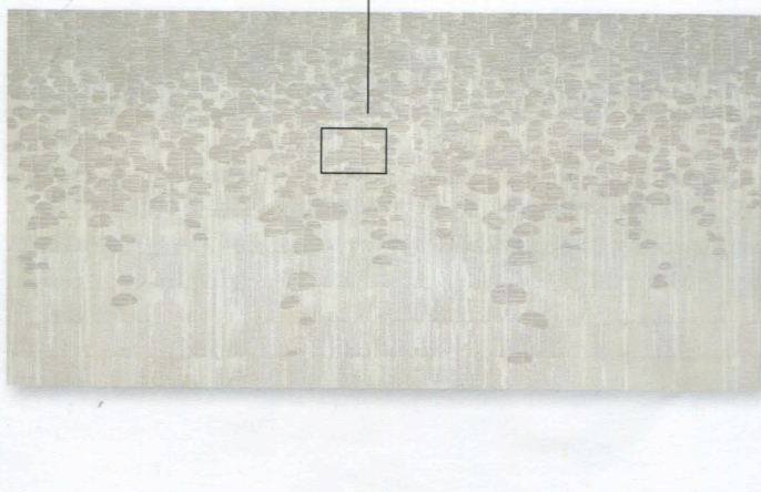
TOP: CHASING THE DRAGON. BOTTOM: ETHER