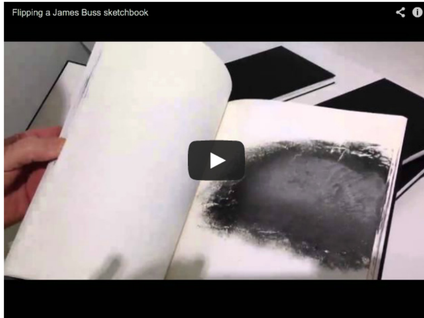
James Buss: Outside the Phantastikon will be on view at Hello Project in Houston through November 8, 2014.

His non-panel pieces don't quite make it. The show includes a shelf full of standard black-bound sketchbooks, marked with printed or stamped blots on random pages. They're not much of anything, and they're not very interesting; the marks fill just enough of the books to push the remaining white space in the direction of lyricism: leafing through one, my first thought was that there was still plenty of perfectly good blank paper left; if I had one, I'd write haiku in it, or a dream diary.