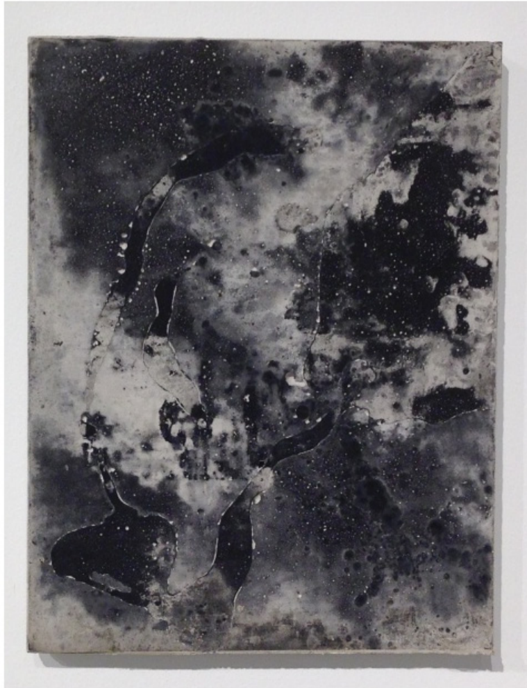
James Buss, Untitled , 2014. Do not attempt to adjust your screens.

The few artistic decisions that have been made have been made well: the limited range of soft, neutral rusts, blacks and grays; the substantial but still wafer-thin plaster tablets; the crumbling ridges of plaster that leaked through cracks in Buss' molds that he leaves as faint clues to his process. Even the mini angle irons that support two of the pieces on the wall are perfectly chosen. The works ooze sensitivity.