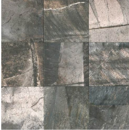
Tile samples, "Porada," deep grey, PR 34 from Daltile.

The refinement of Buss' works is so easy to appreciate it might seem dumb. Over the weekend I spent an hour at Daltile, a high-end tile showroom, sorting through dozens of stone-like variations to find the perfect kitchen floor. Why did it take an hour? Because, even in floor tiles, nuances matter. The Daltile designers (who, after all, went to the same art schools as Buss) are going for the same understated naturalness, using some of the same techniques: textured, earthy materials, and semi-random process.