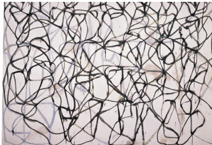
Brice Marden Cold Mountain 6 (Bridge) , 1989-91. Oil on linen, 274.3 x 365.8cm.

Or, for a more contemporary, American example, take Brice Marden's damnably authentic Cold Mountain series. Cold Mountain 6 (Bridge), above, makes the same, essential assertion of the identity between self and nature without Guo Xi's layered symbolism, representational content, or fussy conventions. Marden and Guo Xi are forces of nature, Buss is nature's midwife.