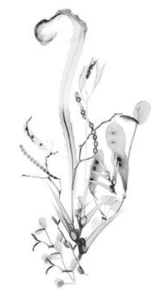
Doherty 2014 Columbianl 50x35 inches

Kim Cadmus Owens continues depicting urban landscapes manipulated and changed with digital influences. Yet, I see Cadmus Owens taking on a subject of shifting and changing landscape with less straight forward nostalgia. It seems every city I travel to, an artist is painting buildings with old signs. Cadmus Owens is not about preserving the past, but rather seeing the past intersect with the present and future. Those lines she paints are not just digital anomalies, but rather Time slicing into the buildings for new building developments or for empty parking lots. Early 20th century Futurist showing a moving in a dog walking with many legs in one painting, Cadmus Owens shows these building in transition, where time, people's dreams, and ideas for these places change. Rubble, imperfect memories, maybe grainy archival photos remain as memorial to these buildings, but Cadmus Owens breathes life back into the old information of these places which really only exist in a moment of time.