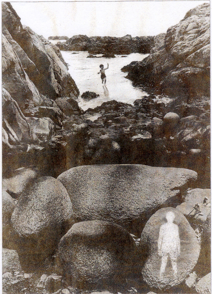
Dallas Museum of Art

While "Coastlines" isn't the best exhibit in recent months at the DMA, the museum's continued effort to mine its own resources for exhibits and to bring more contextualization to the viewing experience is to be commended.