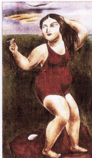
Bather With Cigarette , 1924; Yasuo Kuniyoshi, oil on canvas

The only girl going wild on the walls of the DMA is a smokin' 1924 flapper by Yasuo Kuniyoshi, in a most decorous red knit bathing costume that was surely made of wool.