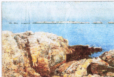
Duck Island , 1906; Childe Hassam, oil on canvas

The only girl going wild on the walls of the DMA is a smokin' 1924 flapper by Yasuo Kuniyoshi, in a most decorous red knit bathing costume that was surely made of wool.