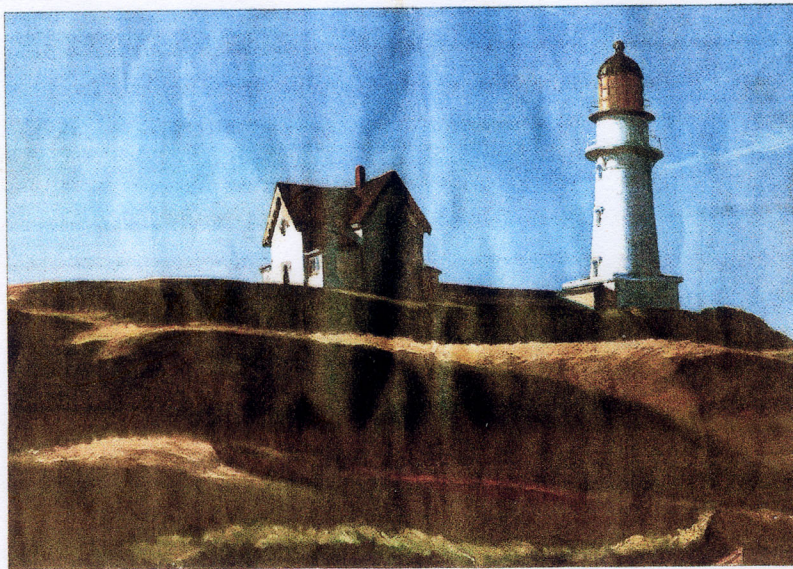
Lighthouse Hill , 1927; Edward Hopper, oil on canvas

Coastlines: Images of Land and Sea runs through Aug. 22. Dallas Museum of Art, 1717 N. Harwood St. $5-$10. 214-922-1200. www.dallasmuseumofart.org