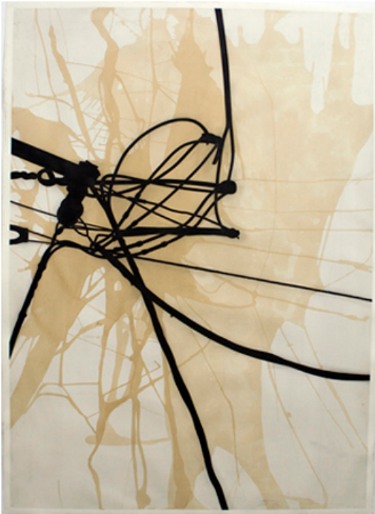
Randy Twaddle, Napalines, 2012, 83 X 60 inches