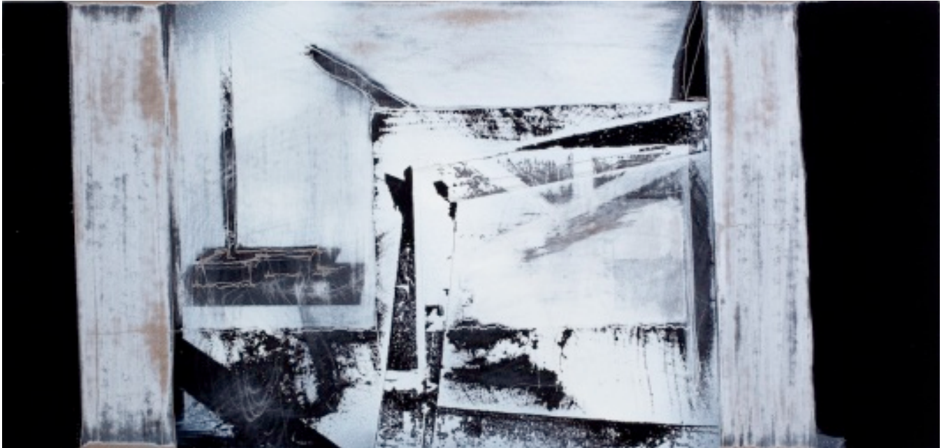
Punk Pass , 2010 | Acrylic on resin-coated panel, 10.5 x 22 inches

to be quieter to allow for this. And, since it was a new surface, I did approach it quietly and reflectively. The black, white, and gray seemed clarifying to me. I felt like I was getting further into what I was searching for in the Portal series.