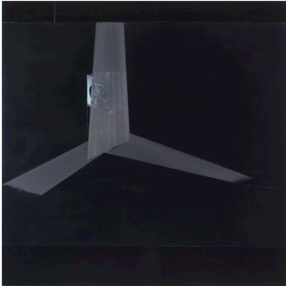
Trefoil , 2010 | Acrylic and enamel on resin-coated panel, 47 x 47 inches

The Portal series was an effort to show a crack in the fabric, perhaps a reveal of another world. Not so much an escapist world, but a glimpse into what's really going on. A bit more like the possibilities that quantum mechanics reveal. I'm always wanting to take a closer look at possibilities and at my own misunderstandings—that is what Portal was about and it is also what the recent black work is about... The “black” work is more about a slow reveal and less about a crack in the fabric. I had a more meditative approach to these paintings and I've been told the viewing process is also meditative, and the associations go into vast territory.