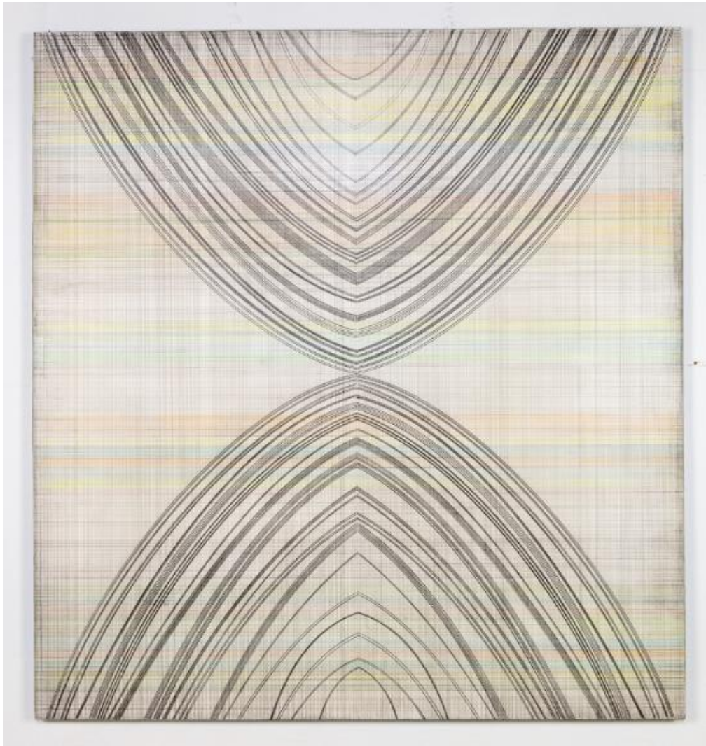
Geometers Condition I, 2016-17, Graphite and Acrylic on Panel, 48 x 42 inches

Something as simple as a line can create a range of emotional suggestions. Next, to the point, the line is the simplest expression in making visual art. Essential and at the core of nearly every work of art throughout the ages, the line helps direct our eyes through an art piece, whether implied or actual. Thick marks can give a feeling of boldness, while a thin wavy line can draw out from the viewer a feeling of nervousness and being unsure. The power of this art element can feel spiritual as well and structurally material.