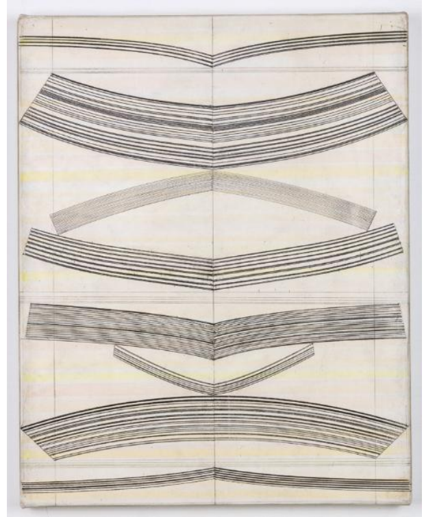
Updraft XVI, 2016-17, Graphite and Acrylic on Panel, 16 x 12 3/4 inches

I found it interesting that Young seals in the grids in order to preserve them from his more invasive process of creating those thicker graphite lines. There was a lot of erasing, slow creation of his graphite marks. The compositions were not set, but rather part of a process changing and redrawing. Much like a textile artist might have to strip out a thread, Young edited and changed his drawings to create a feeling of vibration and invisible presence he was trying to achieve.