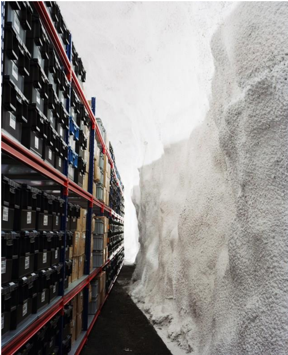
Vault Interior, Svalbard Global Seed Vault Spitsbergen Island, Norway

The vault itself is a cavern located deep inside a mountain so tall that if both polar ice caps melt, the collection of seeds will remain safe