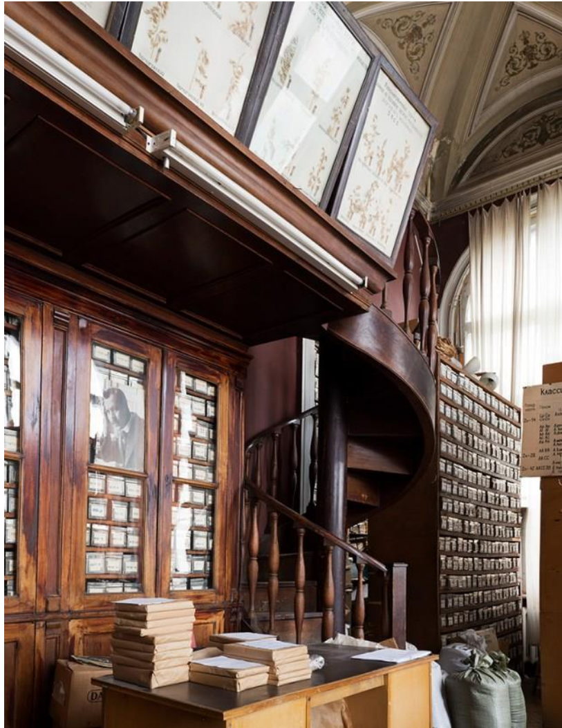
Barley Collection, Vavilov Institute for Plant Industry, St. Petersburg, Russia

The Vavilov Institute is the oldest and most historically significant seed bank in the world. Founded by a prominent botanical geographer and funded by the Russian government, the Vavilov contains an encyclopedic collection of agricultural plants from Asia, Central America, Africa, and Europe. This institution's heroic history includes the death by starvation of twelve scientists protecting the collection during World War II. This Russian seed vault contains a collection of barley, currently at risk due to lack of economic resources.