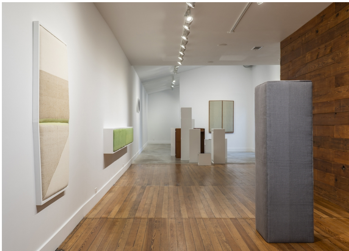
Installation view of “Ana Esteve Llorens: Space is a Reality” at Grayduck Gallery, Jan. 11-Feb. 23, 2020.

Playing with the concept of zooming in and out, Llorens’ domestic-scaled objects give way to a large, architectural installation in the gallery’s high-ceilinged back room. Titled “Space is a Reality,” the enormous bright white monolith and the Donald Judd-esque cube make you feel almost ant-like, dwarfed.