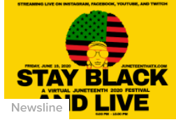
Austin's Juneteenth festival goes virtual this year