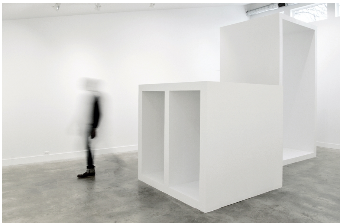
Installation view of "Ana Esteve Llorens: Space is a Reality" at Grayduck Gallery, Jan. 11-Feb. 23, 2020.

Llorens's exhibition is full of juxtapositions — of nature existing beside the machine, of the inside blending with the outside, and of objects that are both strange and yet familiar.