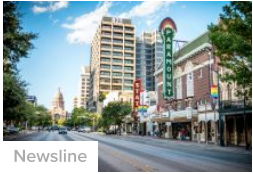
NEA awards $2.6 million to Texas arts groups