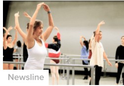
Ballet Austin to resume fitness classes June 9