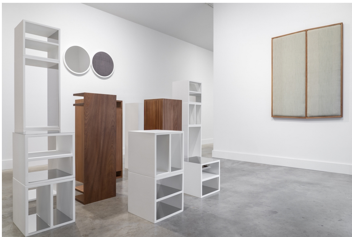
Installation view of "Ana Esteve Llorens: Space is a Reality" at Grayduck Gallery, Jan. 11-Feb. 23, 2020. In the foreground is "Untitled (Units for Space), "2020."

In a solo exhibition at Grayduck Gallery, Ana Esteve Llorens constructs an open-ended narrative through craft techniques and industrial processes