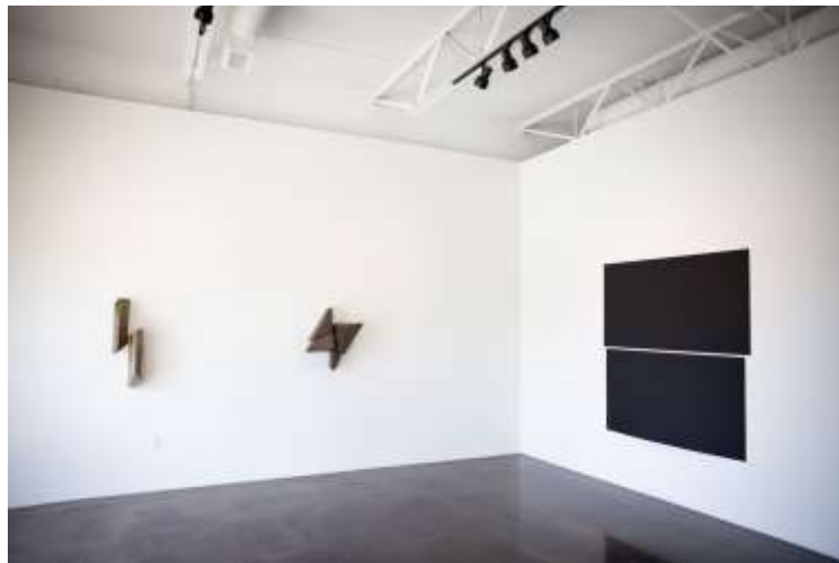
Barry Whistler Gallery

I have been on a week-long state of euphoria after spending time seeing so much art during Dallas Gallery Day. Take out all the driving, and I had the feeling I was at a mini art fair. The Dallas Art Fair opened up their gallery space, which reinforced my feelings. So many familiar faces, with masks, moved in and out of the art spaces. The Dallas art scene was opening up again. Almost everyone had a vaccine story to tell. I don't think I met a single person that hadn't had one or two. The galleries worked the crowds to flow around with respectful distance. Thankfully, the weather was great, so there were moments you could talk outside if things felt too crowded.