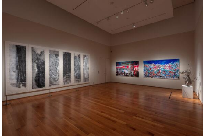
Installation view of “Summoning Memories: Art Beyond Chinese Traditions,” Asia Society Texas, February 10–July 2, 2023.

Top Five: June 15, 2023 – Glasstire counts down the top five art events in Texas.